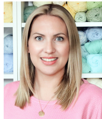
Bella Coco aka Sarah-Jayne Fragola