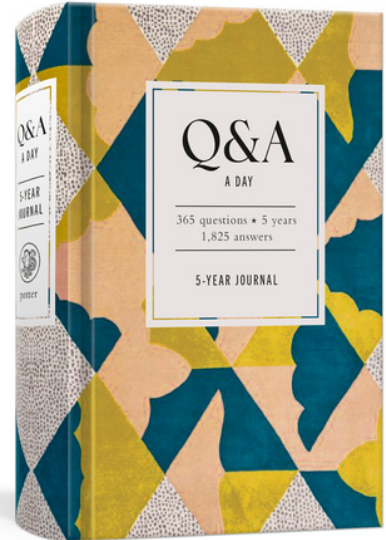
Q&A a Day Modern 5-Year Journal

9780593580202 | 06/06/2023 GUIDED JOURNAL $16.99 | Clarkson Potter