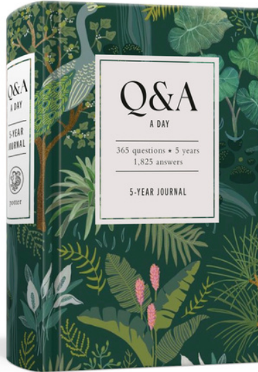
Q&A a Day Tropical 5-Year Journal

3 new editions to Potter's bestselling Q & A a Day series each with varying cover art to appeal to different aesthetics!