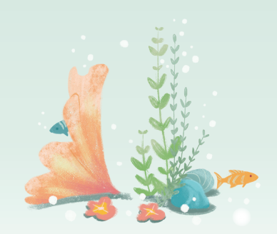
Illustrations copyright © 2022 by Joanie Stone