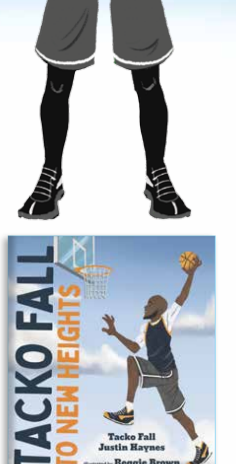
Illustration copyright © 2022 by Reggie Brown