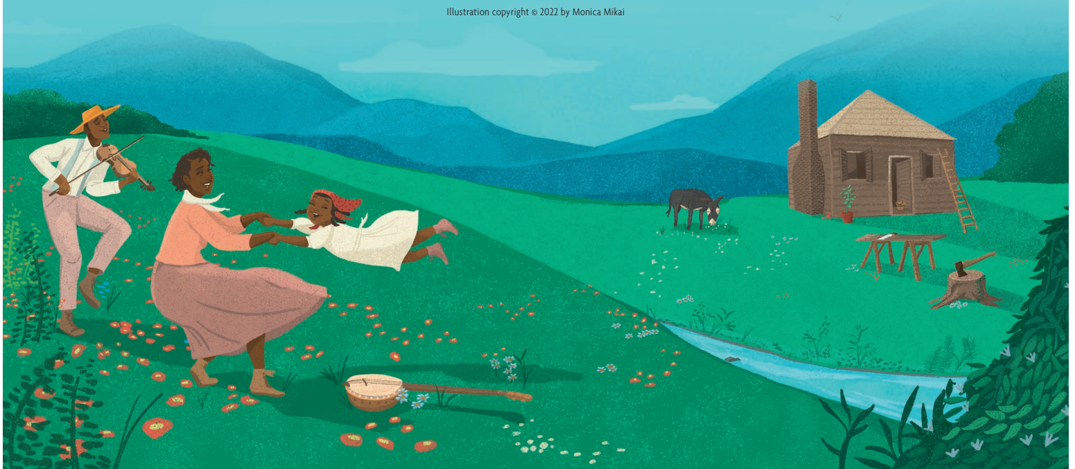
Illustration copyright © 2022 by Monica Mikai